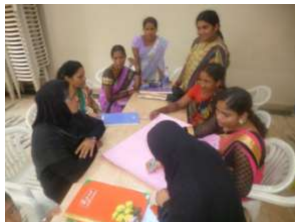
SHG training programme and group discussion