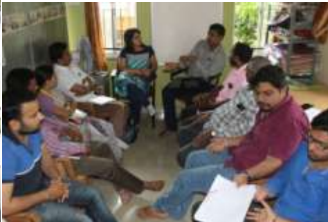
NABFIN officials discussing with staff and EdelGive Representatives attended staff meeting