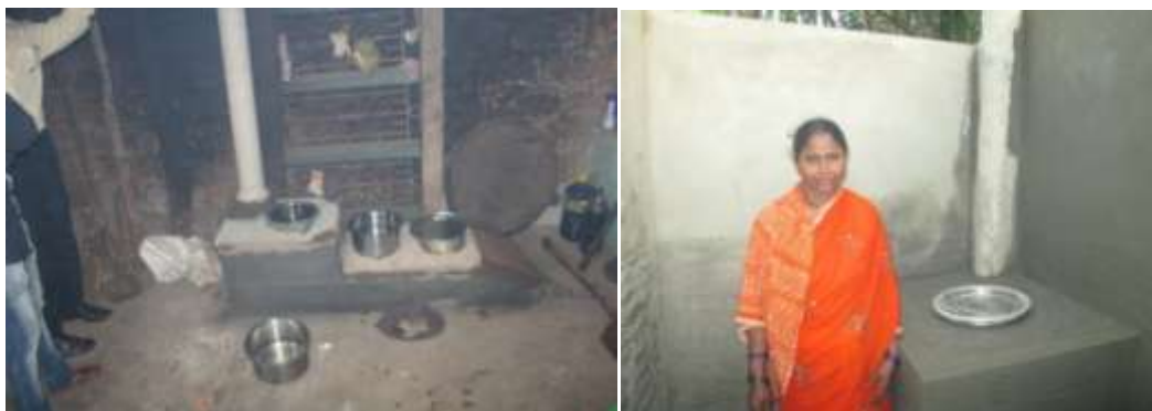
Photo of Kitchen stove and Bath stove