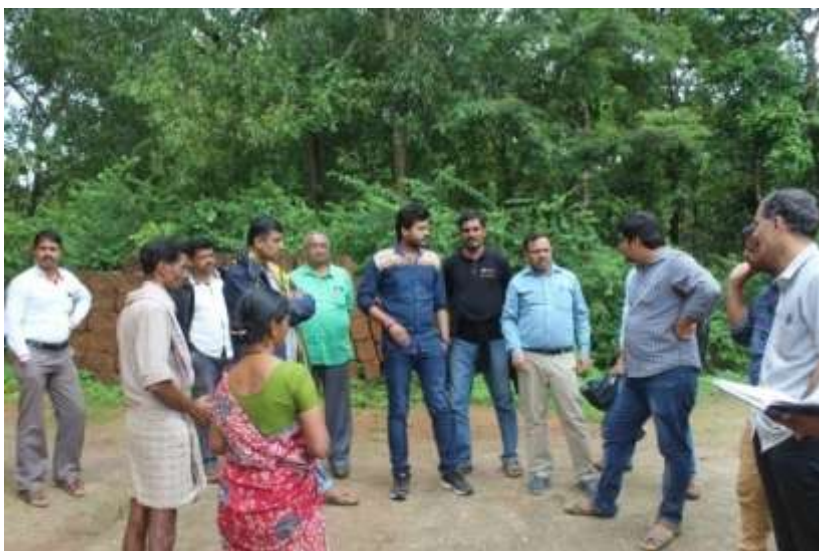
TATA trust representatives visit