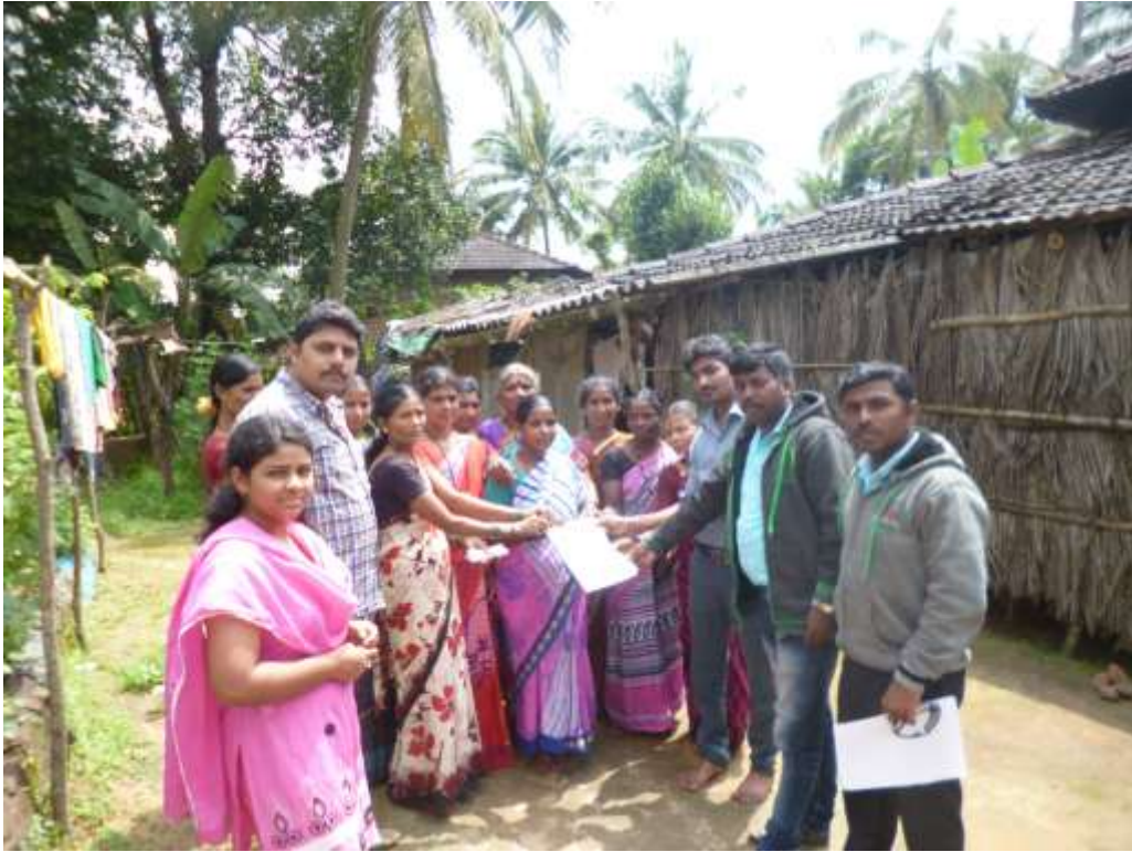
We provide service at door step through co-operative