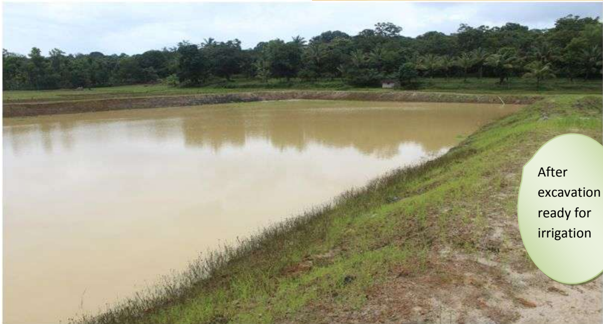
After excavation ready for irrigation