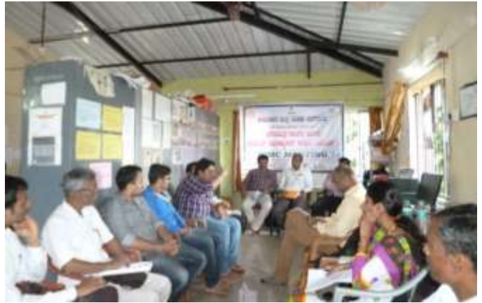
Project Implementation and Monitoring Committee meeting