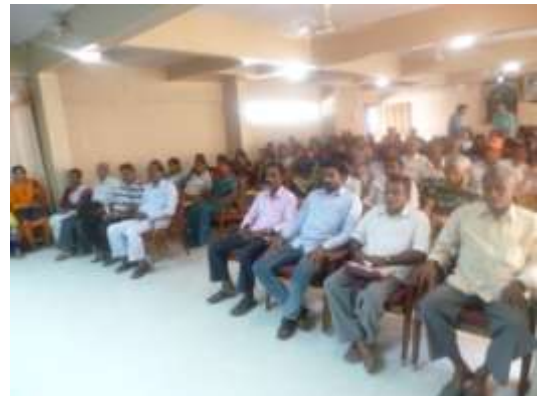
Block level FPC members training at Sirsi