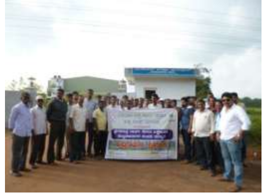
Exposure trip to the FPC members to the Areca processing centre, Bulk storage and pepper plantation in Shivamogga district