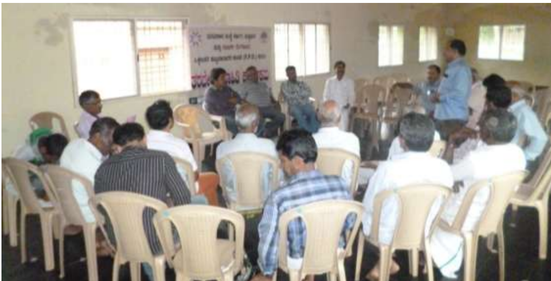
Cluster level meeting of FPC at Siddapur