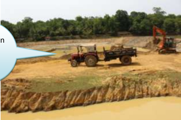
Excavation & soil shifting