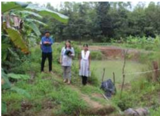
Ms. Swarnamayee from UNDP GEF SGP attended staff meeting and visited activity spots