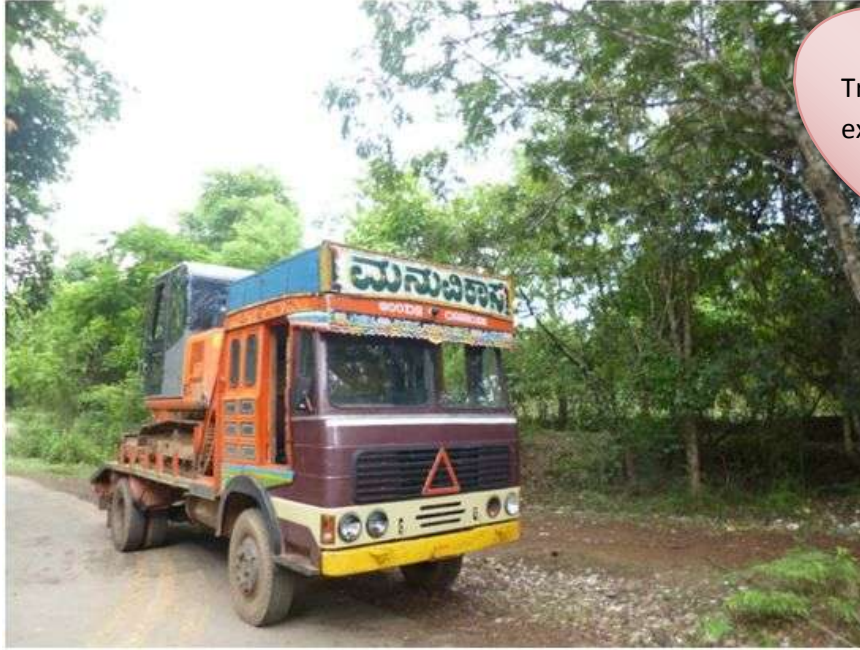
Transportation of excavator