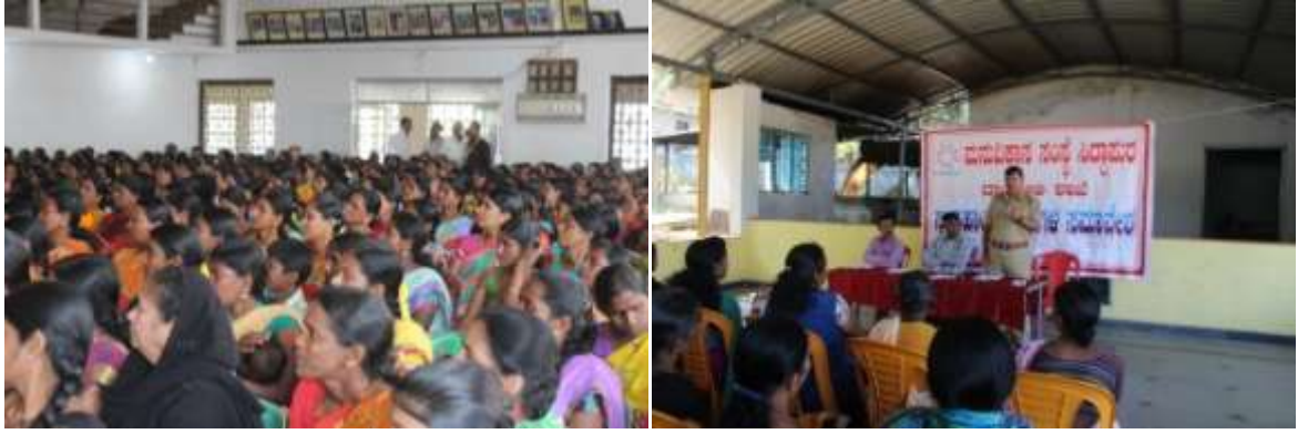
Annual federation meeting of SHGs in Sirsi and legal awareness programme in Dandeli

MANUVIKASA has started JLG (Joint Liability Groups) promotion with the help of NABARD since three years. Total 1148 JLGs are promoted and 1148 JLGs are linked with the bank loan of Rs. 16.22 Crores. Most of the groups are represented by women and are involved in different types of Income Generation activities. Each member of the JLGs has got an average loan of Rs. 40000.