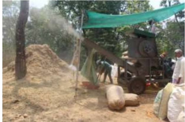
Activity spot of the FPO and areca de-husking machine