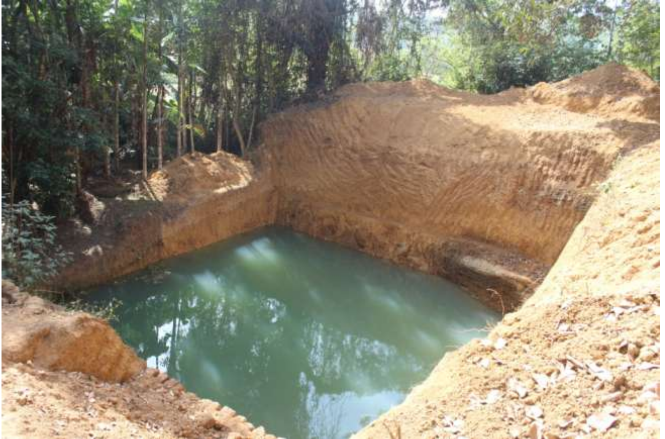
A farm pond constructed in Sonda village by MANUVIKASA