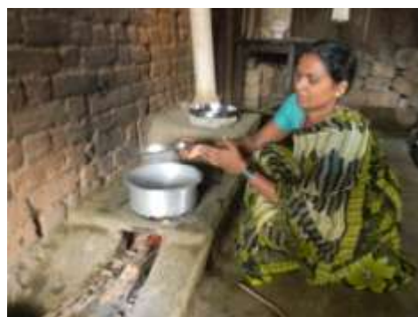
Cooking of food using fuel efficient stove